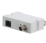
LR1002-1EC Single-port EoC Receiver