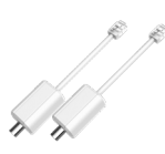
LR1002 EoC Passive Converter