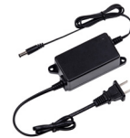
DH-PFM320D-US Power Adapter